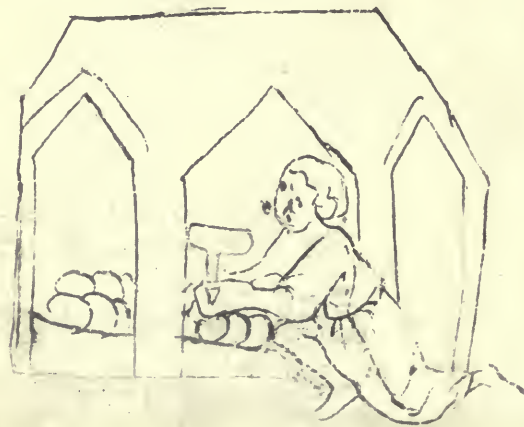
THE OUTRAGE AT WESTMINSTER.

A nno regni regis eduardi tricesimo se- cundo. papa benedictus dum apud perusium uerbum dei populo predicaret: inter cetera deplorauit abominabile exitium in uicarium ihu xpi et petra commissum. nec tantum casum persone desle- uit. quinimo ipsum xpm a militibus pilati tantum spoliari asserens. captum dampnandum. et tanquam remortuum planxit in carne uelut in sepulchro triduo a militibus custoditum. non ut dicit apostolus xpc resurgens ex mortuis iam non mortuus et cetera. uerum est in carne iam glorificata. et sicut dixit et xpc petro interroganti. domine quo uadis: an uenio romam tantum crucifigi. Intellexit ergo hoc