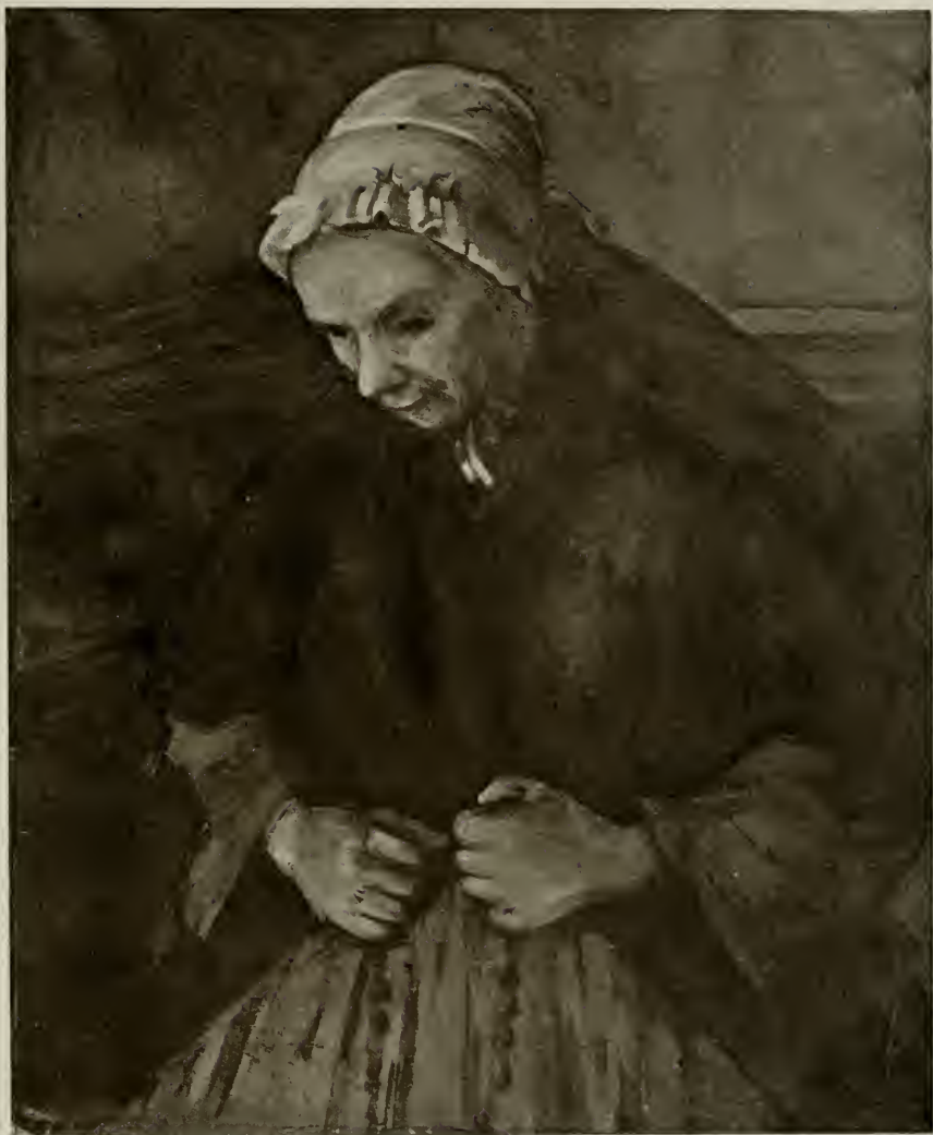
WOMAN WITH THE BEADS