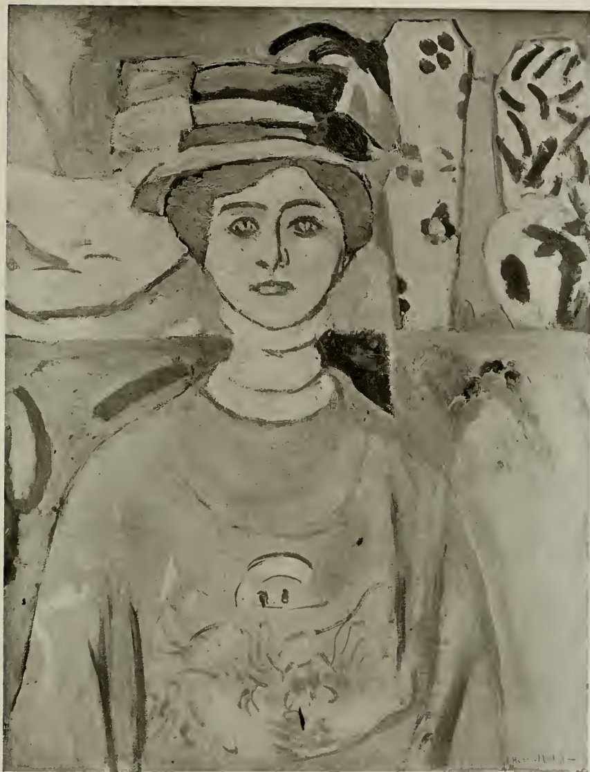
THE WOMAN WITH THE GREEN EYES