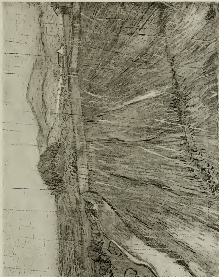
RAIN EFFECT BY VINCENT VAN GOGH