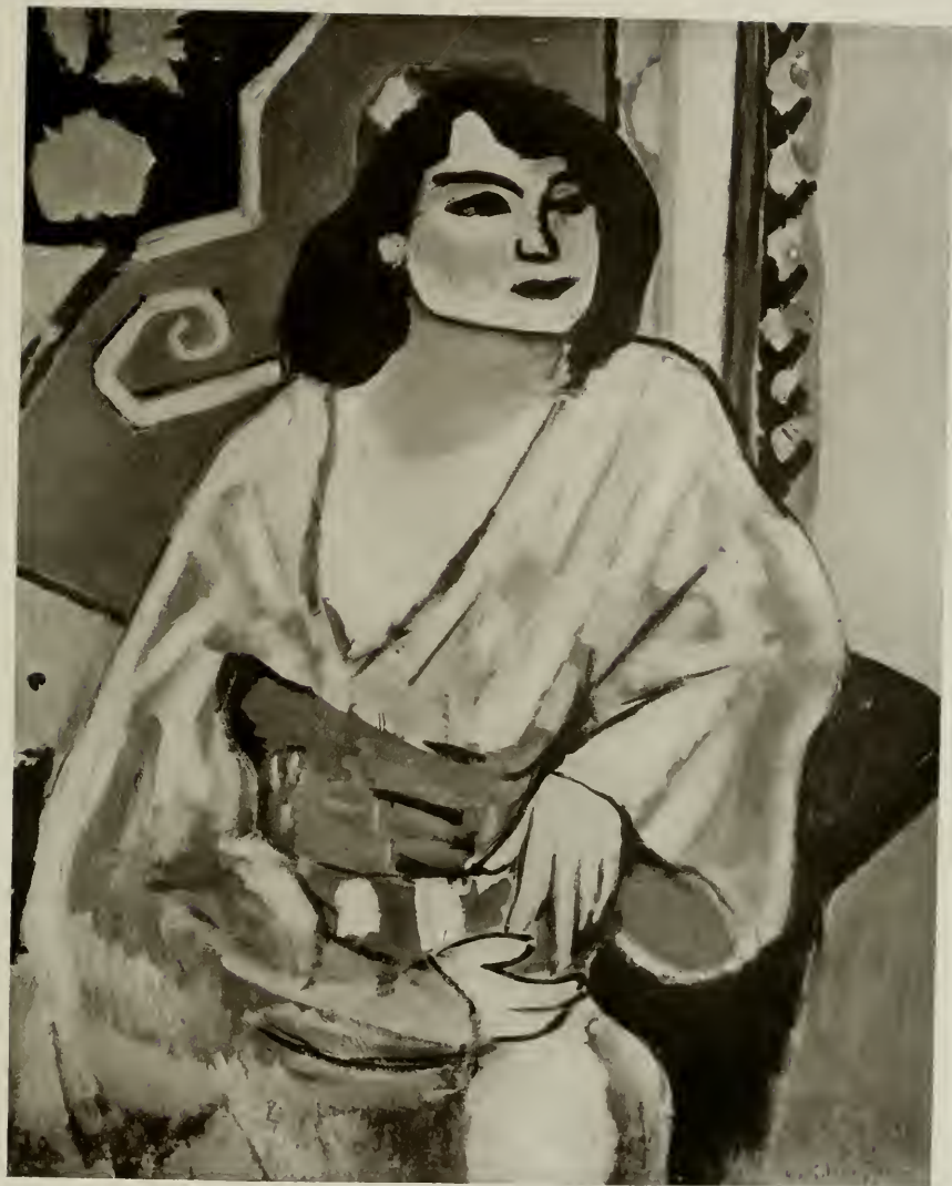
STUDY BY HENRI MATISSE