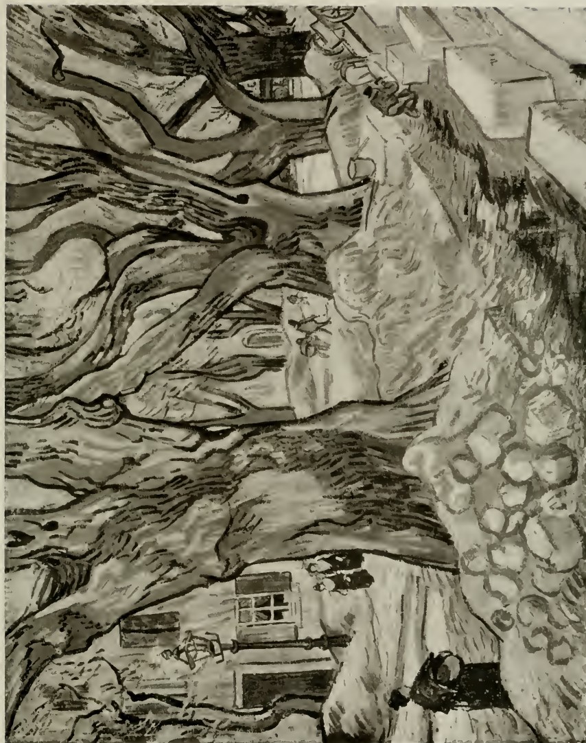
STREET AND TREES BY VINCENT VAN GOGH