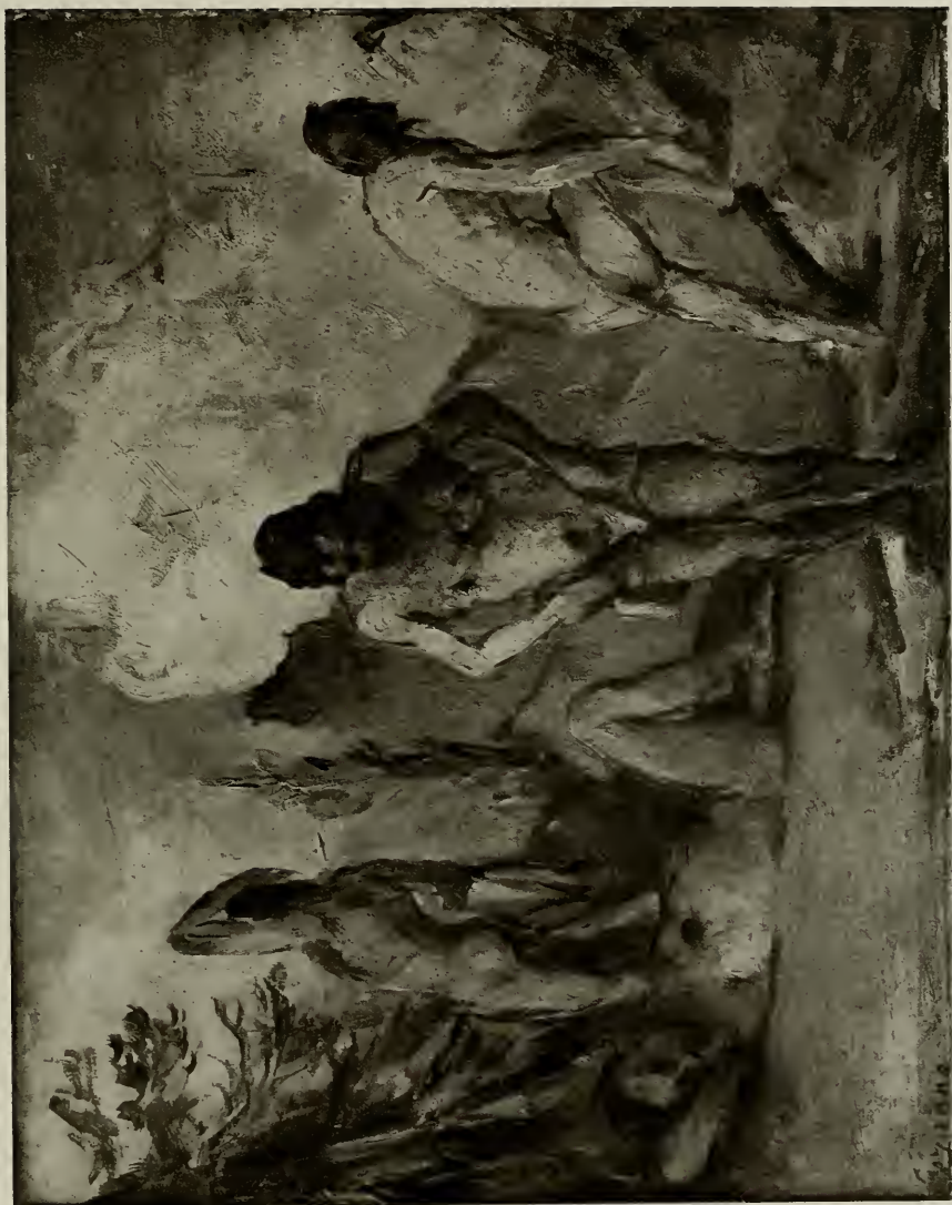
THE BATHERS BY PAUL CÉZANNE