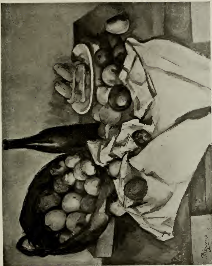
STILL LIFE BY PAUL CÉZANNE