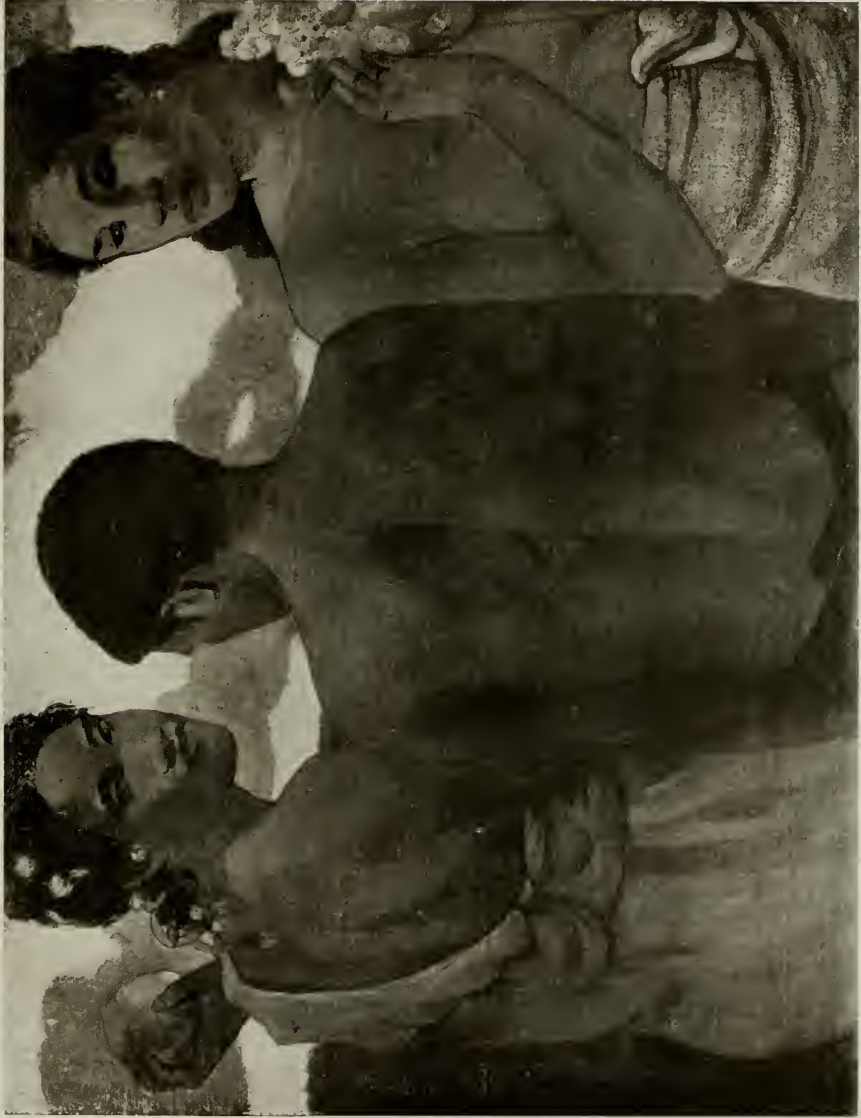
A TAHITIAN GROUP BY PAUL GAUGUIN