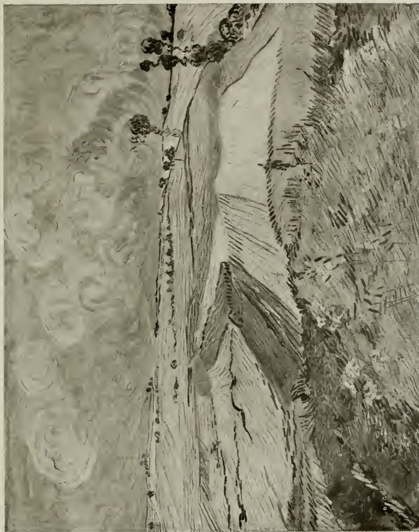
THE FIELDS BY VINCENT VAN GOGH