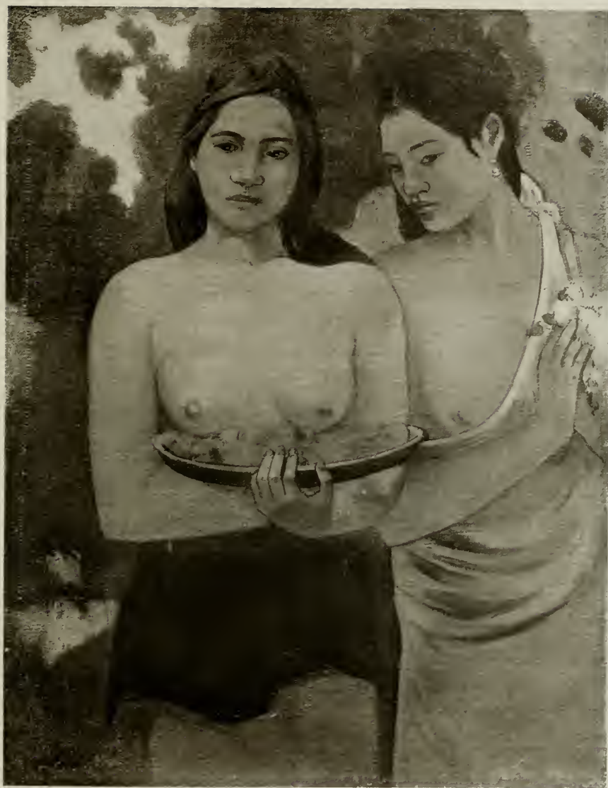
WOMEN OF TAHITI BY PAUL GAUGUIN