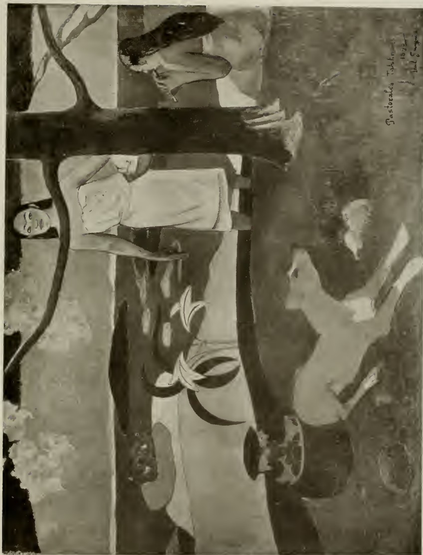
TAHITIAN PASTORAL BY PAUL GAUGUIN