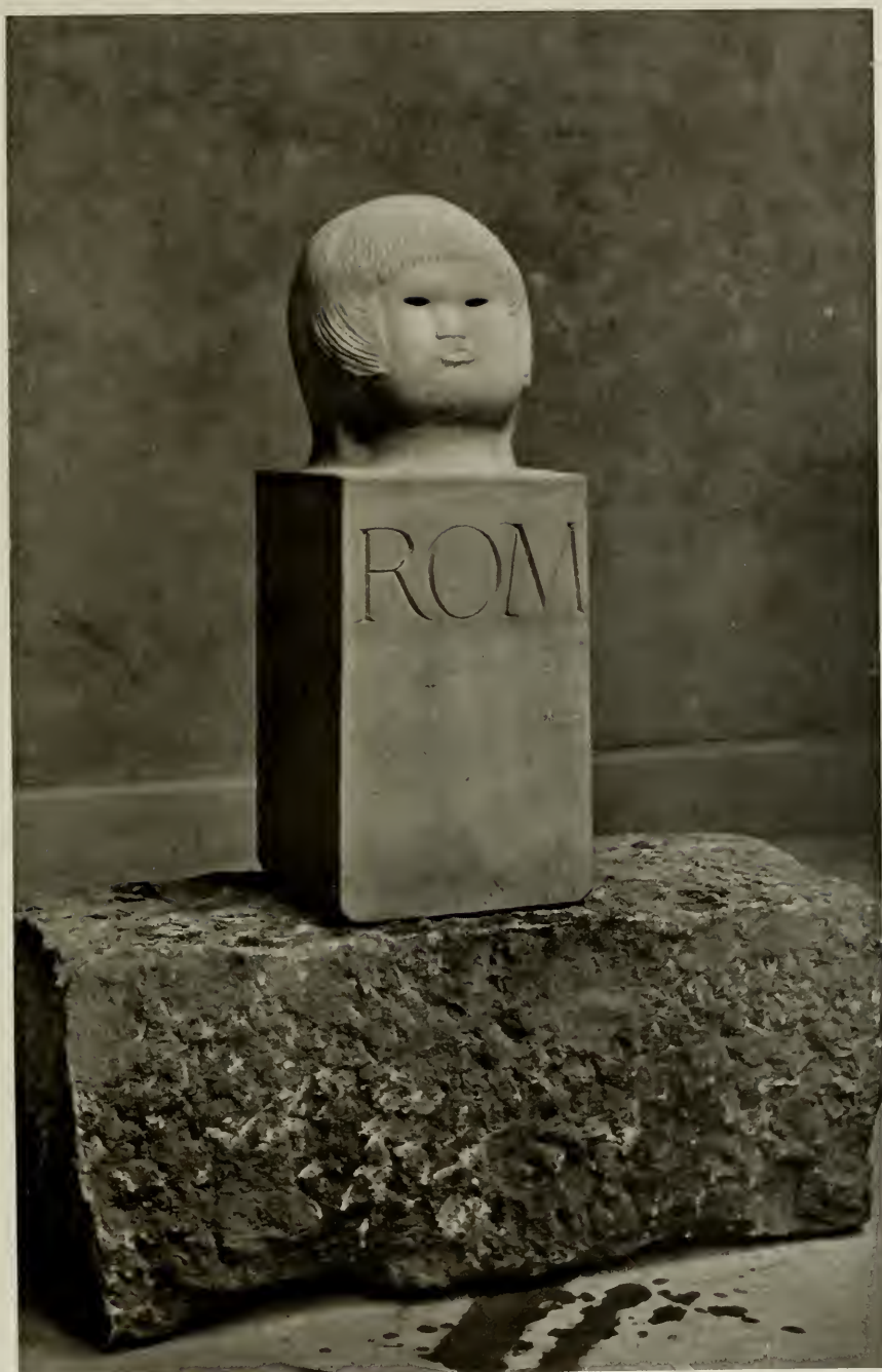
THE CHILD BY JACOB EPSTEIN