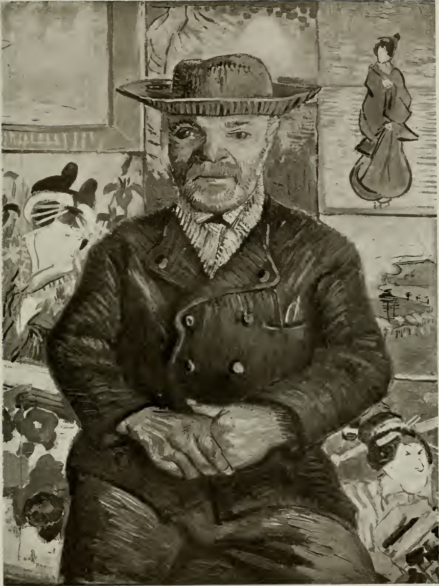
PÈRE TANGUY BY VINCENT VAN GOGH