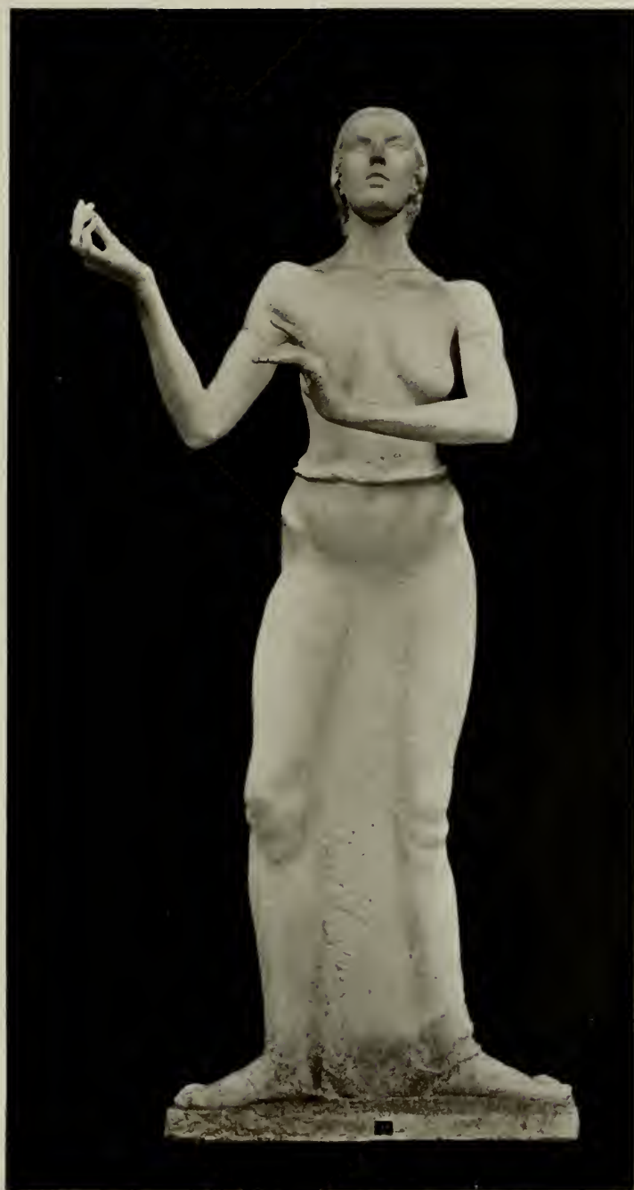
EUPHEMIA BY JACOB EPSTEIN