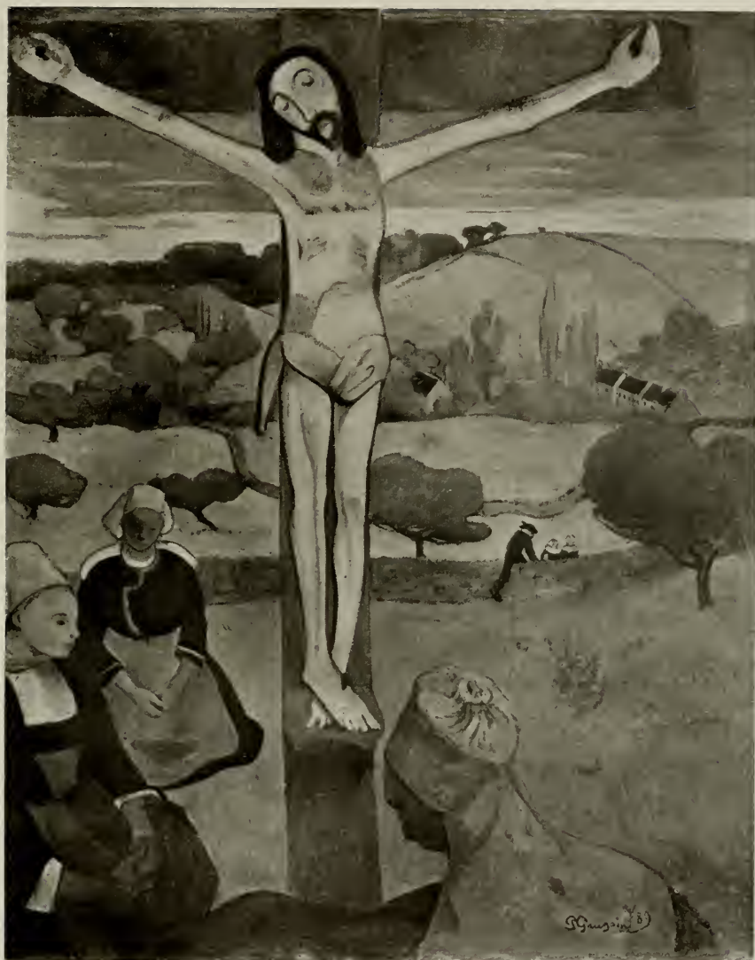
THE WAYSIDE CHRIST