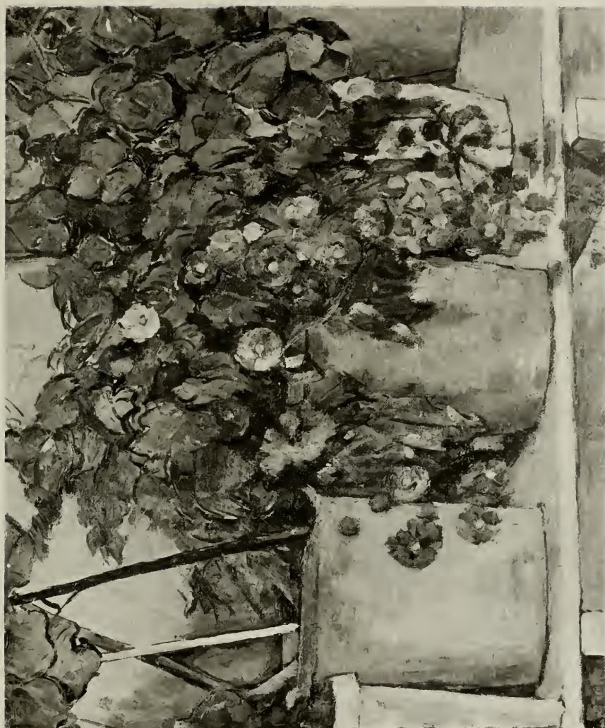
STILL LIFE BY PAUL CÉZANNE