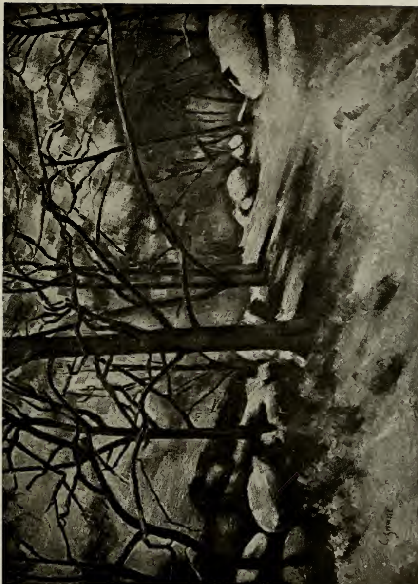
LANDSCAPE BY PAUL CÉZANNE